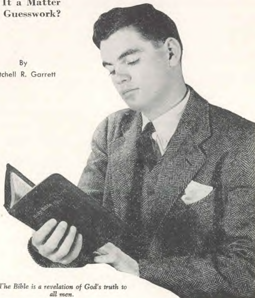
The Bible is a revelation of God's truth to all men.