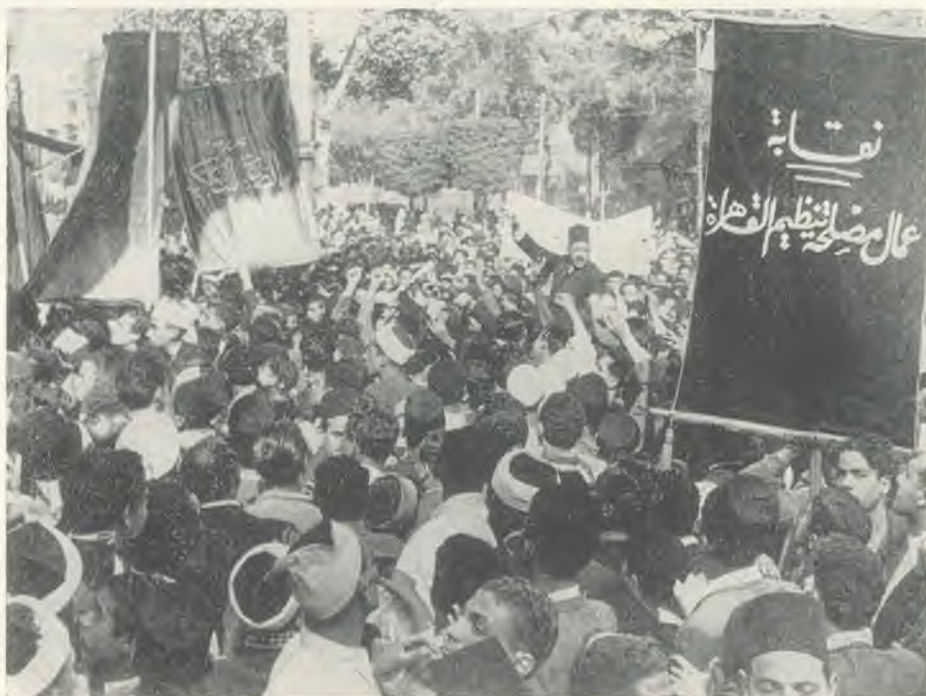
The Arabs in all parts of the world are aroused, and are getting ready for a holy war if the United Nations goes ahead with its plans for the partitioning of Palestine.

Everything is being speeded up in this time of the end. The world is rushing on at a breakneck momentum toward its doom. When the Bible speaks of the judgments of God that are to come in great fury, it says that "He will lift up an ensign to the nations from far, and will hiss unto them from the end of the earth: and, behold, they shall come with speed swiftly." Isaiah 5: 26. The wrath of God is coming swiftly, and we must quickly prepare to meet the crises ahead.