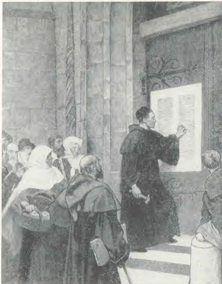
When Luther nailed his theses on the Wittenberg church, he initiated Protestantism's great doctrine of salvation by faith.

Romans 6:23 we know that "the wages of sin is death," but He did no sin. Why should He die? Ah! Here is the secret of true salvation. He died as a substitute for all those who would believe in Him.