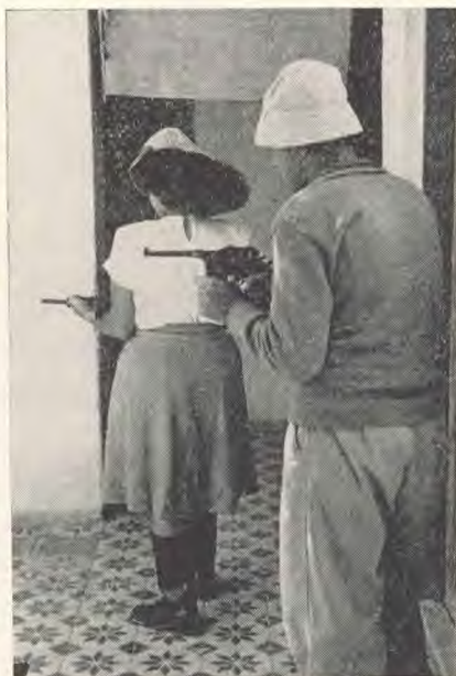
This Jewish boy and girl are desperately determined to win Palestine.

peace originated. The religious leaders of the Moslem world are calling the faithful to a holy war. Hordes of fierce warriors are astir who fanatically believe the Holy Land to be theirs. They are getting ready for a showdown with Zionism. From Syria, Lebanon, Iran, Trans-Jordan, Egypt, Saudi Arabia, and Yemen the battle cry is heard.