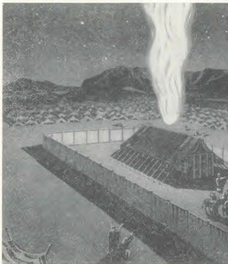
Important truths are learned in studying about the present priesthood in heaven. In Psalm 77