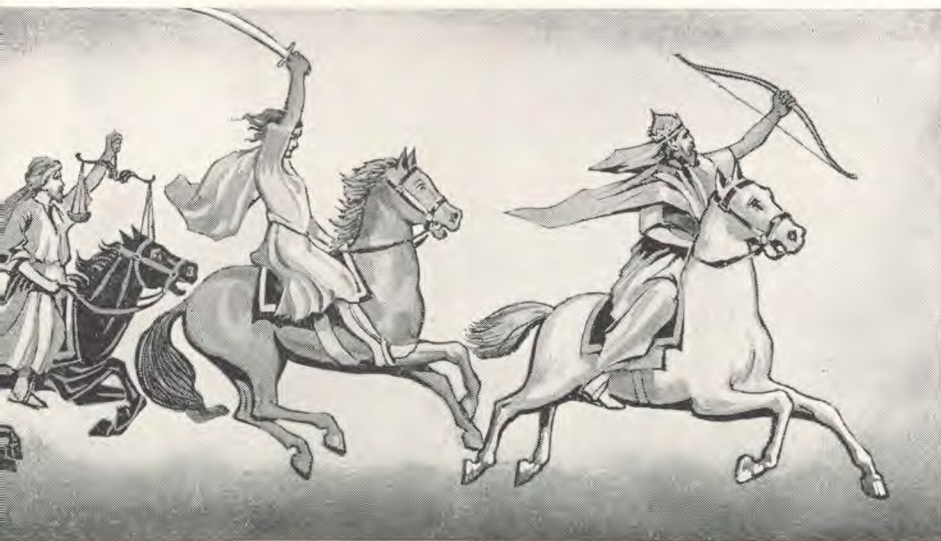
startling prophetic significance, and open up to us light on important matters in world history.

Hence the color of the horse used as a symbol is white, denoting purity. It was because of this that the church was victorious in its witnessing, and in its endeavor to carry the good news of a Saviour to all the world.