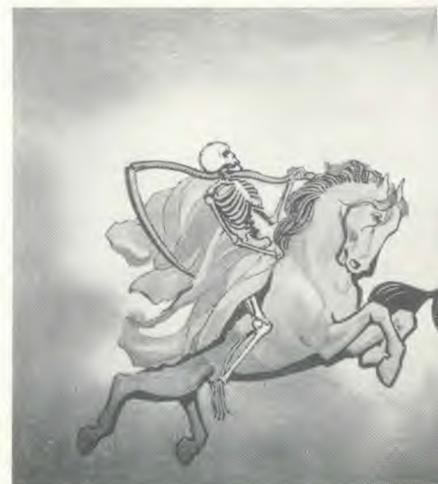
The white, black, red, and pale horses of Revel

Then he saw Jesus, under the combined symbol of the Lamb who has died for our sins and the Lion who has conquered Satan, come forward to open the book. John beheld this majestic Revealer of secrets reach forth His hand and take the book from the hand of His Father, and break seal after seal. And as He did