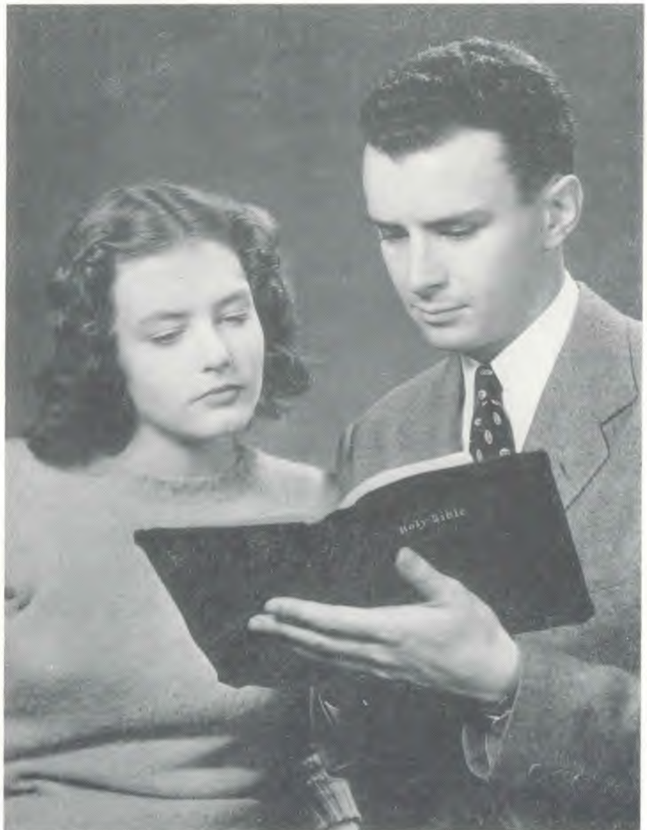
The Bible is the great guidebook for young and old, and should be studied with more intense interest in these crucial days when God is sealing His saints for eternity.

Four angels are here represented as holding the winds in restraint as they are about to sweep over the earth. Winds in Bible prophecy, are used to represent wars, commotions, turmoils, and political upheavals. Jeremiah both used the symbol and explained it. "And upon Elam will I bring the four winds from the four quarters of heaven, and will scatter them toward all those winds; and there shall be no nation whither the outcasts of Elam shall not come. For I will cause Elam to be dismayed before their enemies, and before them that seek their life: and I will bring evil upon them, even My fierce anger, saith the Lord; and I will send the sword after them, till I have consumed