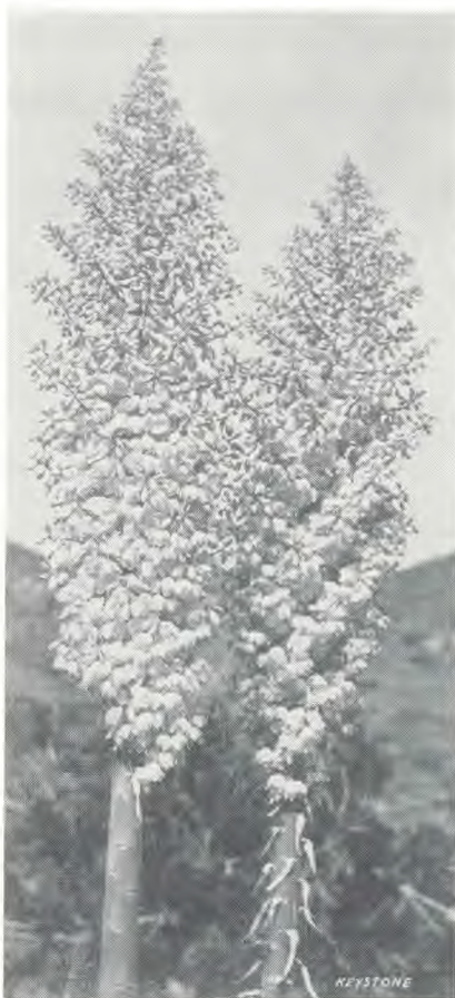
There is a remarkable partnership between the insects and the trees and flowers.

A further strange relationship between plants and the insect world is found in the numberless galls. Possibly the most familiar is the oak gall, or "oak-apple," and the blackberry knot gall. The first is a round green ball; the second is a knotty, ridged enlargement on the stem. These galls are formed by punctures of the inner bark by the lancetlike ovipositor of female insects (mostly gnats) in the process of egg laying. Then begins an amazing process in which the wounded plants, irritated and stimulated by the chemical nature of the egg and the sting, begin the building of tumors of hypertrophied tissue enclosing the eggs uniformly, which soon hatch into larvæ, which feed upon the juices of the central cavity of the galls. Thus the galls are at this stage parasitic. In the process of