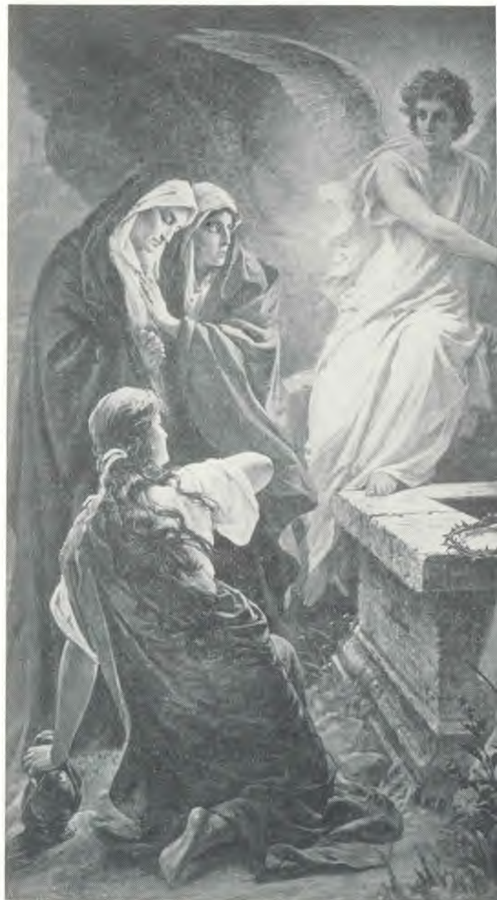
B. PLOCKHORST, ARTIST

Sundaykeepers, therefore, in appealing to the resurrection of Christ on Sunday as authorization of the first-day Sab-