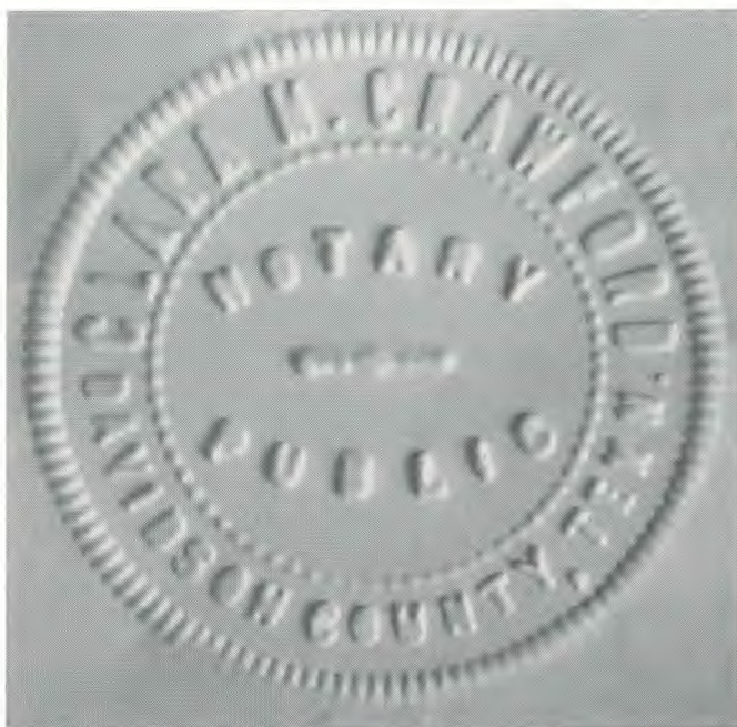
A seal placed on a document or law must contain the name, title, and territory of jurisdiction of the sealer to make it legal. Where do we find these three things in God's Law?

This passage in Isaiah is a counterpart to the prophecy of the sealing work in Revelation 7:1-3. It has reference to the same time, the time when men "wait for Jehovah," and "look for Him." It is a time when men are girding themselves and con-