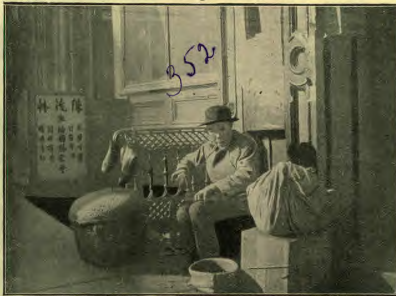
A CHINESE SHOEMAKER AT WORK IN THE STREET

FROM childhood I had been interested in missions. In college the greatness of the kingdom of God began to take hold of me, and I often revolted against the general indifference to foreign missions and the frequent prejudices against it. From time to time I would think of missions as possibly my own life-work, but this first became a subject of continued thought when I entered the theological seminary. Life had begun to focus, and the choice of a particular field became an imminent question. Here, also, for the