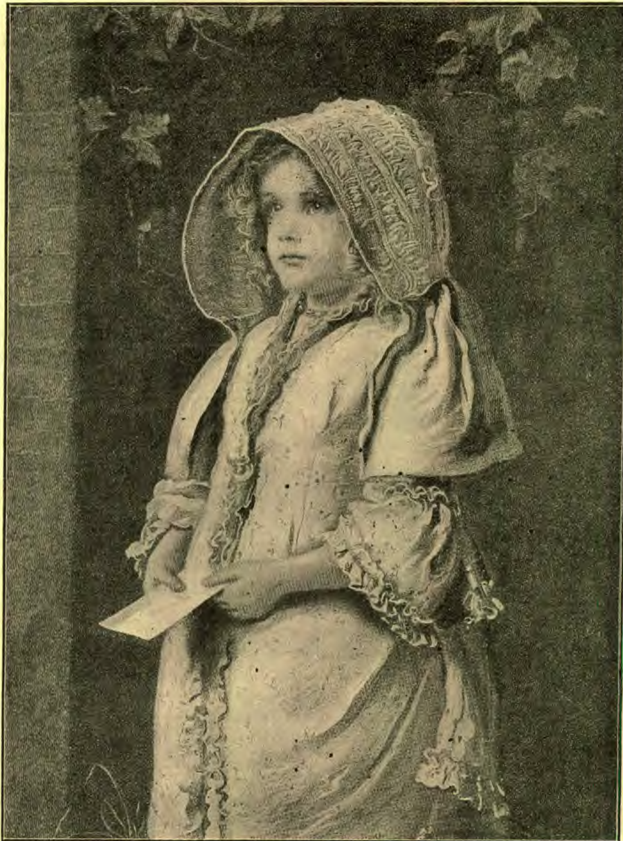
A SWEET OLD-FASHIONED GIRL