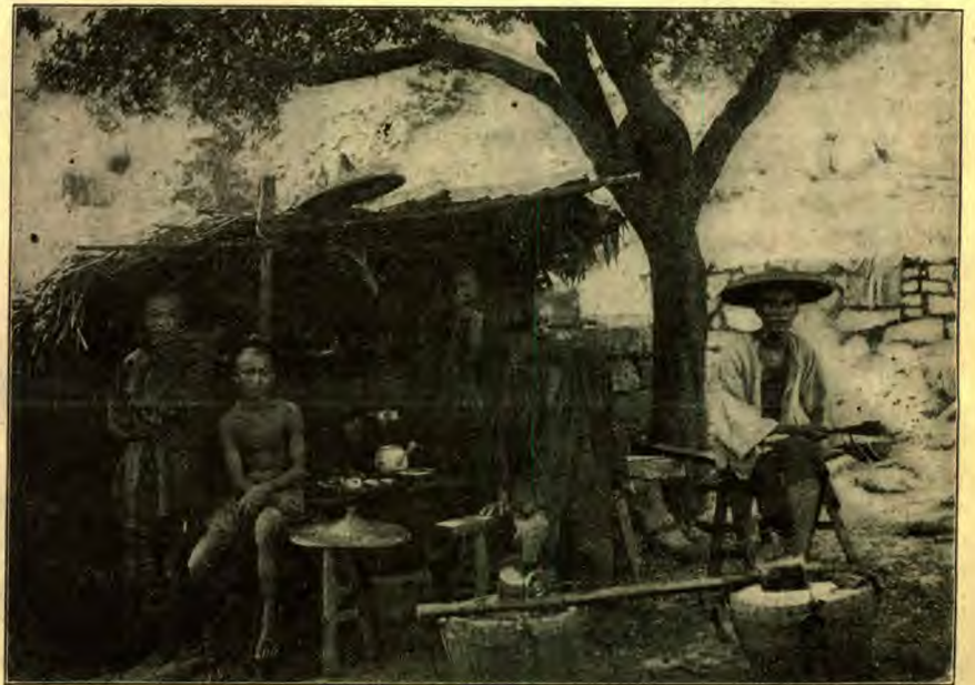
A BOOTH RESTAURANT IN THE STREET

sageway, it is not an easy task to make one's way through them because of the many obstructions. The carpenter piles his logs in front of the shop, and fills up half the street; a man wants his house freshly plastered with mud, so he has five or six cart loads of earth hauled and dumped in the middle of the street, there to remain for probably three or four weeks. The tanner lines the street in front of his shop with hides for the people to trample on, and thus hasten the tanning process. The farmer, coming in with his load of straw, cane, stalks, or