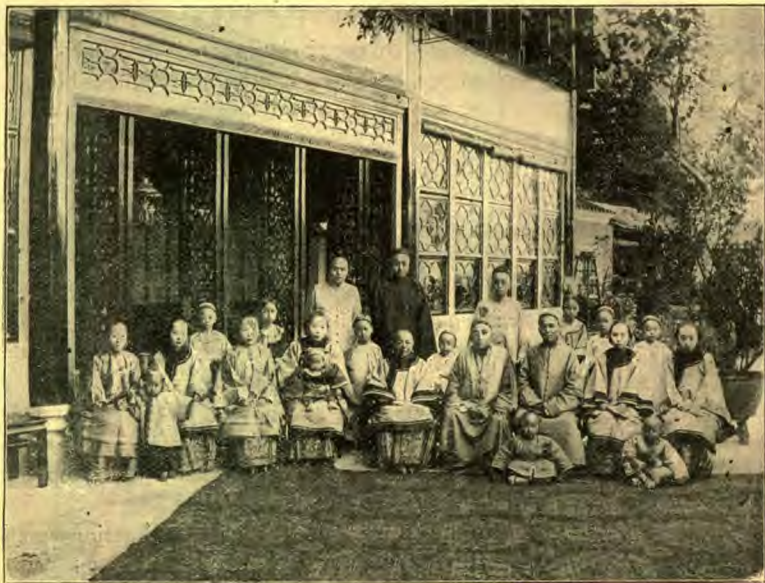
THE FAMILY OF A WEALTHY CHINAMAN