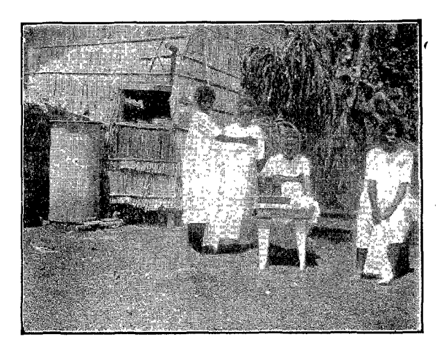
The Sewing Class, Dovele. Native Girls Making Their Own Dresses

What striking examples, or symbols, are these two experiences of dedication or consecration of the soul temple to God. With anxious, painstaking care, Moses saw that the most minute detail of each requirement was fully and perfectly met. All that human hands could do