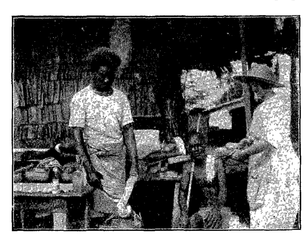
Dovele Treatment Rooms, Solomon Islands

In order to arouse and awaken the generation that will be living when the Saviour returns, and to prepare