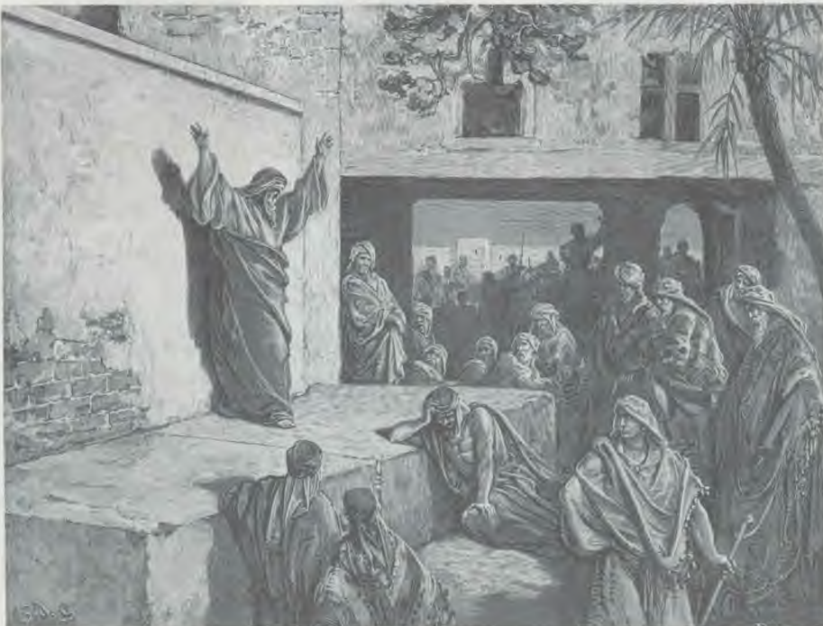
Jeremiah was one of the Biblical prophets raised up by God to declare His will.