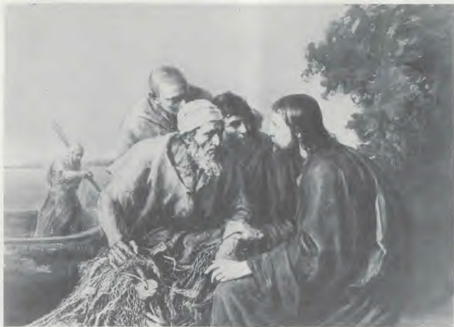
Peace comes with dependence on divine power, on Christ's strong—yet tender—love.

"I, even I, am He," the Lord declares, "that blotteth out thy transgressions for Mine own sake, and will not remember thy sins. Put Me in remembrance: let us plead