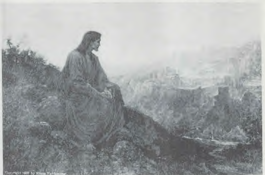
Every aspect of the Messianic prophecies was fulfilled in the One who is the Christ.

The vision of Daniel 7 expands and supplements the dream of Daniel 2, emphasising the investigative pre-Advent judgment in preparation for the handing over of the kingdom of God to the saints (chapter 7:21, 22, 24-27). In Daniel 8 appears another vision, one that enlarges upon aspects of the former. It pinpoints the time element of the pre-Advent judgment and reveals additional aspects of the cleansing of the heavenly sanctuary. The vision of Daniel 11-12 reaches from the time of the Persian period to the time of trouble when Michael shall stand up to rescue His faithful remnant people (chapter 12:1) and death will be overcome through the resurrection (verses 2, 3). The amazing fulfilment of portions of these dreams and visions is the guarantee that the aspects that as yet remain unfulfilled will surely come to pass.