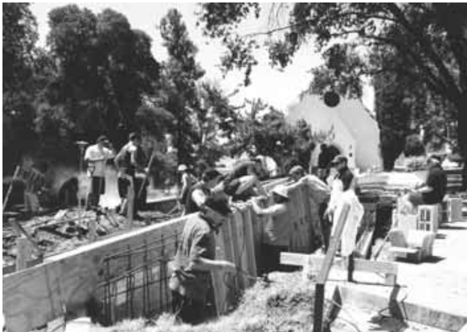
Adventist young adults from Australia have helped build a landscaped patio at La Sierra University as a tribute to contemporary heroes.