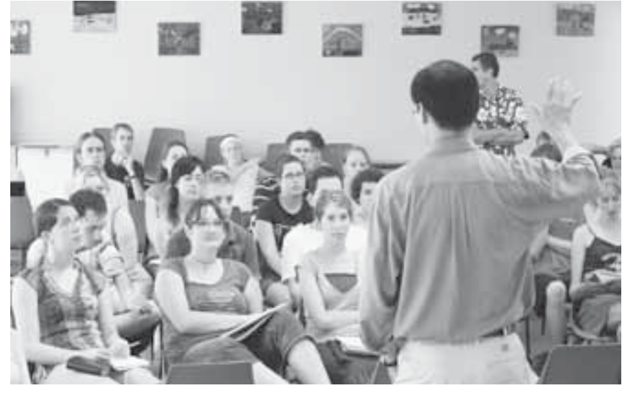
Student leaders discuss discipleship at the Adventist Students' Association's annual leadership-training weekend.