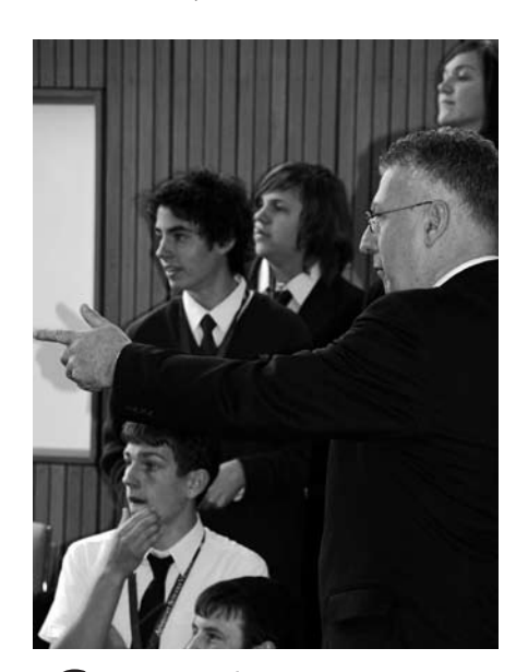
Growing students in Victoria