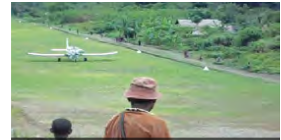
The plane arrives on the new airstrip.

to complete using both traditional and modern tools.