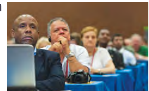
The congress highlighted a growing tension between religious freedom and secularism.

Chartered in 1893 and sponsored by the Seventh-day Adventist Church, the