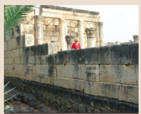
The white fourth century BC Capernaum synagogue is believed to be built on the black basalt foundations of a first century synagogue, which the apostle Luke seems to indicate was built by the centurion whose servant Christ healed.

Above all the Capernaum synagogue testified to the grace that is received by faith alone. When its builder, a Roman centurion, requested Jewish elders to ask Christ to heal his servant, in a typical "works of the flesh" fashion, they said he "deserved" Christ's help for what he did in building them the synagogue. What a contrast to the centurion, who, sensing his "unworthiness", put his trust in the power of Christ's word alone. Why not right now do the same, claiming His word for your great need? Read Luke 7:1-9; Matthew 8:5-13.