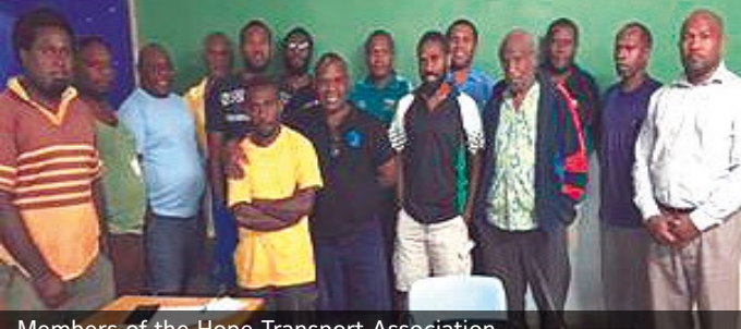
Members of the Hope Transport Association.

"We may not be able to see the result of the literature given out but God's Spirit will water these seeds and Jesus will share with us the result when we get home."-TPUM Newsletter