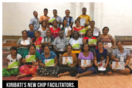
KIRIBATI'S NEW CHIP FACILITATORS.

On the island of Tarawa, Kiribati, 19 people were trained as CHIP facilitators and they are also planning to run their first program.