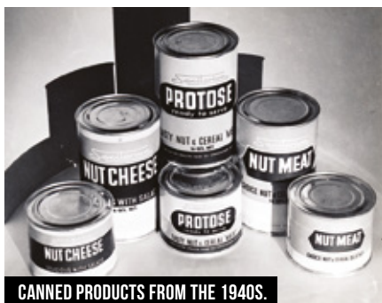
CANNED PRODUCTS FROM THE 1940S.

If you are keen to share your favourite Vegie Delights recipes with other Vegie fans, now is the time. Vegie Delights is giving away $A1000 in prize money this February for the most creative and delicious ideas. Head to < vegiedelights.com/recipecompetition > or page 2 in this Record for more information.