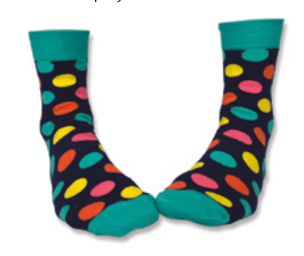
100 PER CENT OF PROFITS GO TOWARD THE PROJECT.

To support the program and spread the message of good health across the Pacific, you can make a tax deductible donation to <10000toes.com/> or purchase a pair of socks via their shop, where 100 per cent of the profits go toward the project.