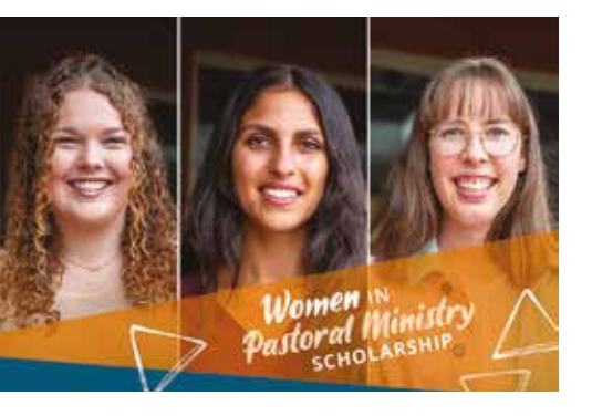
There is a limited number of scholarships available for 2023.