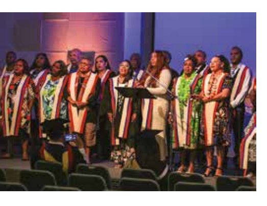
At the graduation ceremony, Mamarapha College celebrated the achievements of nearly 30 students.