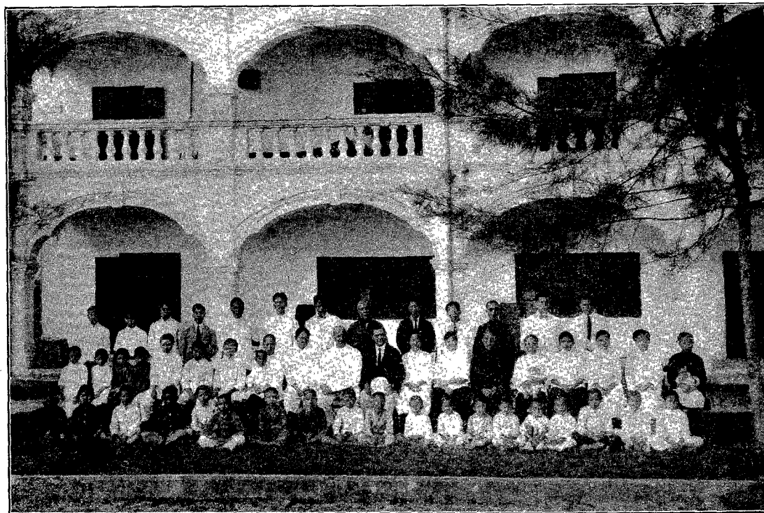
Workers and believers in attendance at the conference of Seventh-day Adventists held in Jesselton, British North Borneo, in October, 1923

"How far do you come to attend our meetings?" I inquired of a promising young Chinese brother who speaks good English. "Oh, I come for nine miles," was the reply. "And