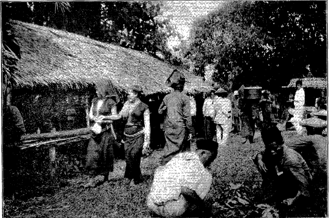
Dusuns at a country market-place in the Borneo forest a few miles back of Jesselton. It is within two miles of this market that our first mission station for the Dusun people has been opened