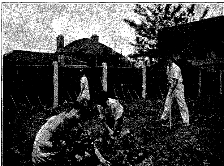
Corner of School Garden

The Far Eastern Academy is established to educate the children of Seventh-day Adventist missionaries in the Far East. In the matter of standards, environment, and opportunities we aim to maintain and, if possible, exceed those of like institutions in the homeland. The OPPORTUNITY is here! Are you taking advantage of it?