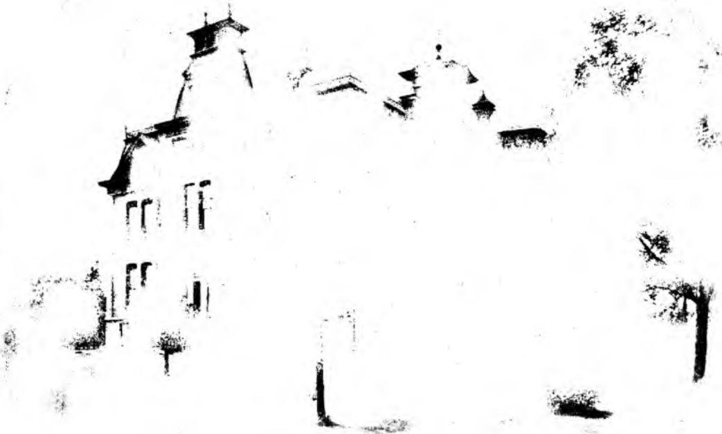
BATTLE CREEK COLLEGE.—A Training School for Christian Workers, Battle Creek, Mich.