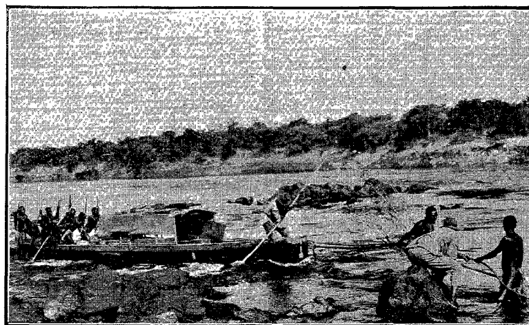
BOAT BELONGING TO KALIMBEZA MISSION BEING PULLED OVER THE RAPIDS

"I had the Lusaka teachers together for a three days' revival, and found out that three more villages have built schools and huts for the teachers. When I visited the commissioner, he told me of two other villages that had done the same, and he made the remark that we were the most called-for society with which he had anything to do. The pitiful thing about it all is that we have no teachers nor money to answer these calls. I certainly hope that it will be possible for us to do some advance work during the next year."