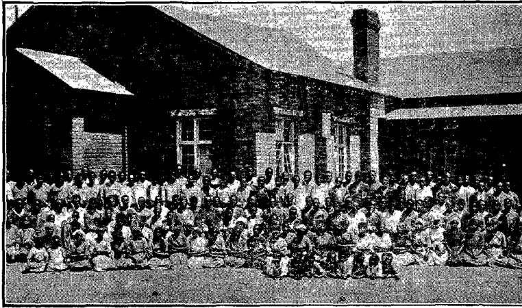
TEACHERS' INSTITUTE AT SOLUSI MISSION