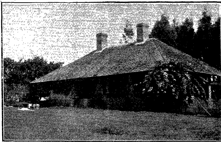
HOSPITAL IN NYASALAND

By pulling grass and leaves, I fixed up a very comfortable bed and enjoyed a good sleep of two hours, when three lions came along and interrupted me. They continued circling around the neighbourhood for nearly an hour and a half and then passed on. A little while on in the night, a wild boar came, and about twenty or one hundred yards from the camp was killed by a leopard. He put up a valiant fight, but