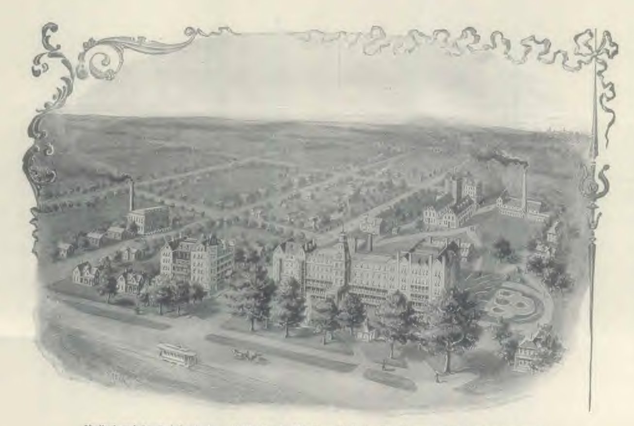
Medical and Surgical Sanitarium, Battle Creek, Michigan, U. S. A. The Largest of its kind in the world.