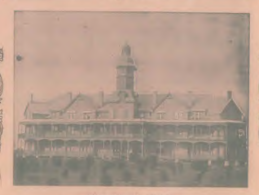
MAIR BUILDING OF LASTABIUM

A Choroughly Scientific Medical and Surgical Sanitarium.