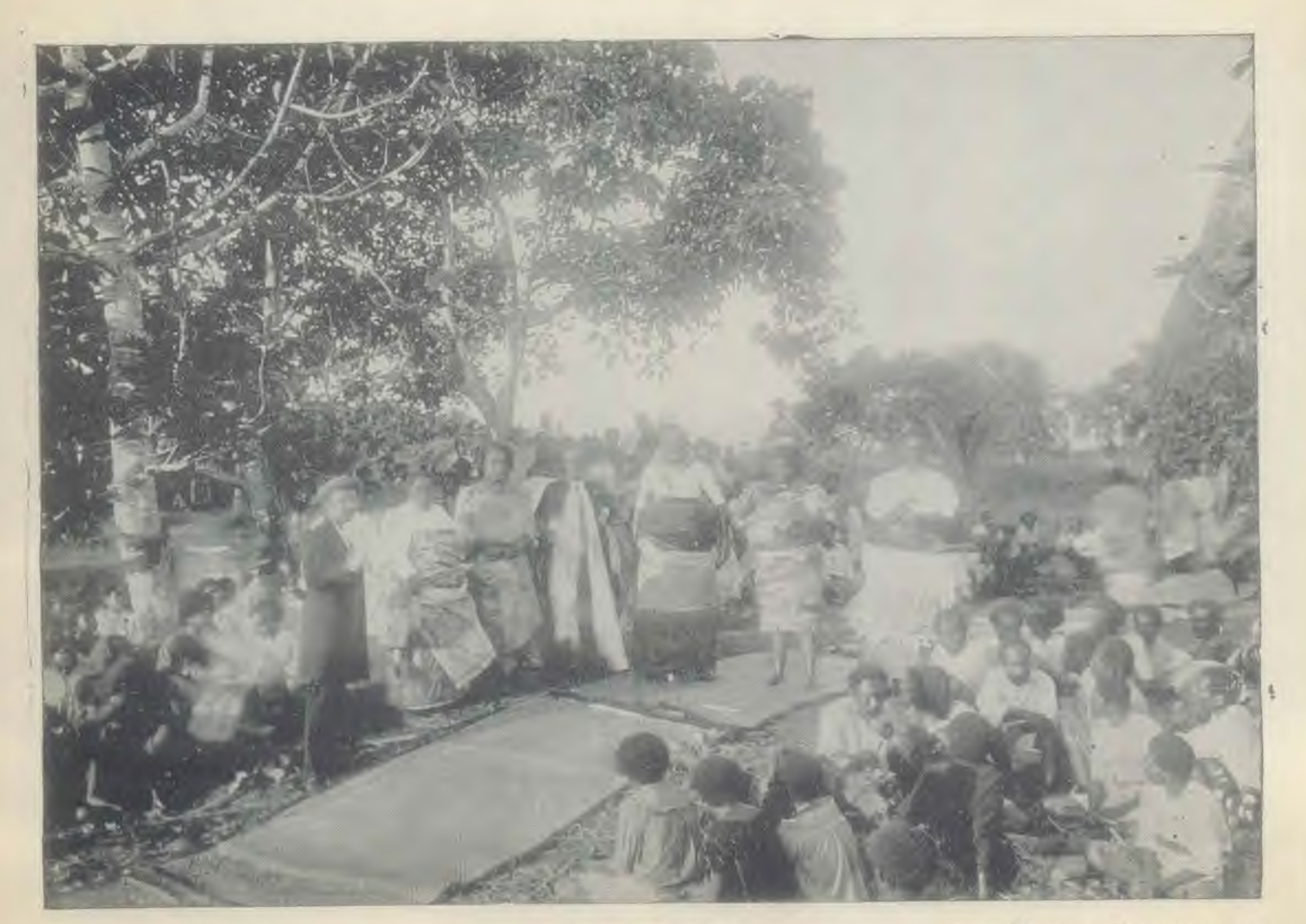
A Gala Day in Fiji.