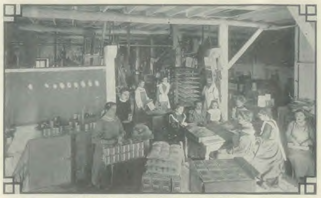
Packing Room of Sanitarium Health Food Factory.

We have been looking in the other direction so long that we sometimes forget the reaping time, but we must think of that also. We must not let anything attract our attention away from the one great work of getting well both spiritually