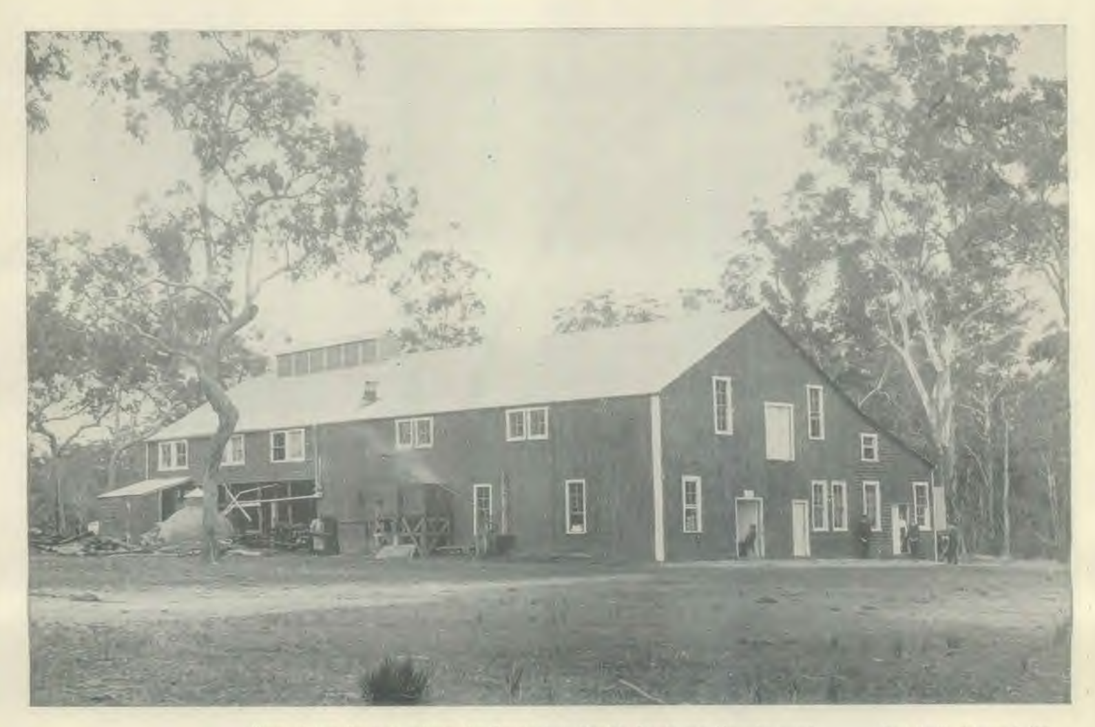
View of the Factory where the Sanitarium Health Foods are Manufactured