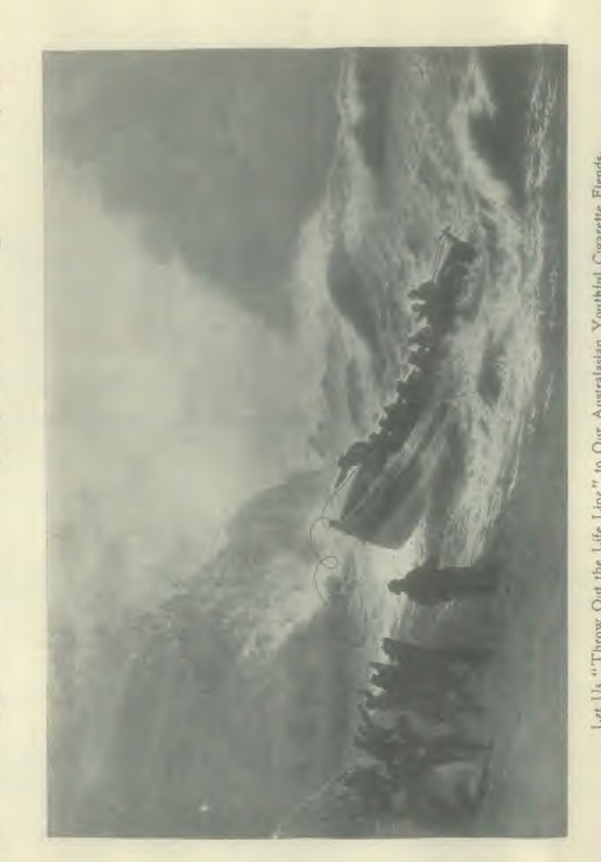
Let Us "Throw Out the Life Line" to Our Australasian Youthful Cigarette Flends.