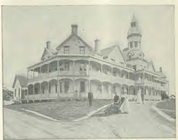
Main Building of the Sydney Sanitarium.

I have found immense benefit from the Sanitarium treatments and diet which I have been following for upwards of a year. Before going to the Sanitarium, frequent headaches used to prostrate me, sometimes for twenty-four hours at a time. I was a martyr to indigestion and constipation, my complexion was sallow and the whites of my eyes were a muddy yellow. Now my acquaintances remark that I am looking better than they have ever before seen me. I certainly feel free from indigestion, and headaches are a thing of the past. I shall do all I can to spread the knowledge gained while at the Sanitarium.