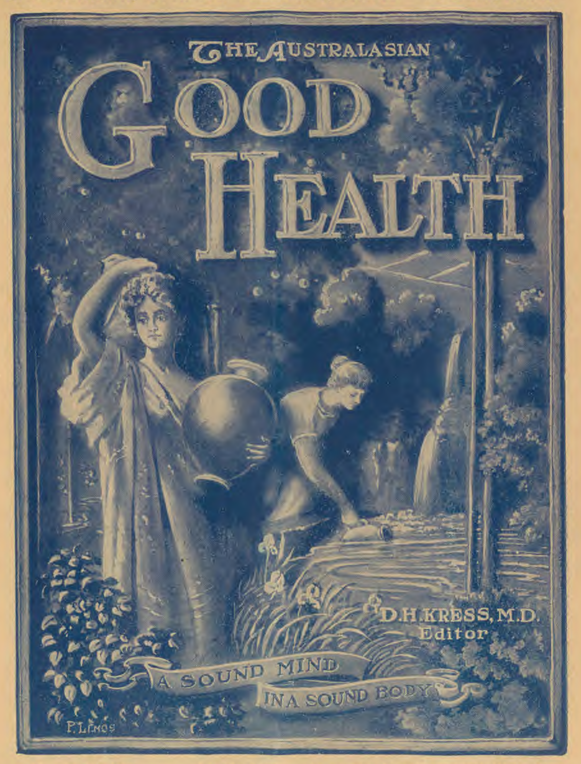
2s. 6d. per Year. 3d. per Copy. R. Z. and Foreign Subscriptions, 3s. REGISTERED AT THE C. P. O. SEDNEY, FOR TRANSMISSION BY POST AS A NEWSPAPER.

COORANBONG, N. S. W., MARCH 1, 1907. VOL. 10, No. 3.