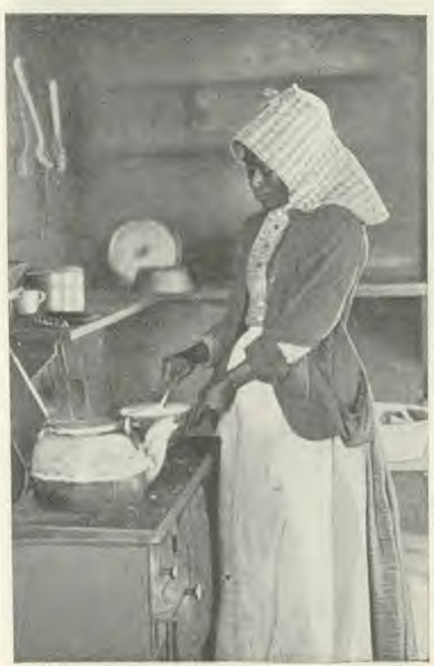
"There's Everything in Knowing How,"

Be sure that the milk used is obtained from healthy cows, and that it is properly handled by reliable dairymen. In the home modification of the milk, use extreme care to have every utensil absolutely clean. This is necessary because milk serves as such an excellent medium for the growth of such germs as produce diphtheria, scarlet and typhoid fevers, tuberculosis, and cholerainfantum. Should any of these disease germs