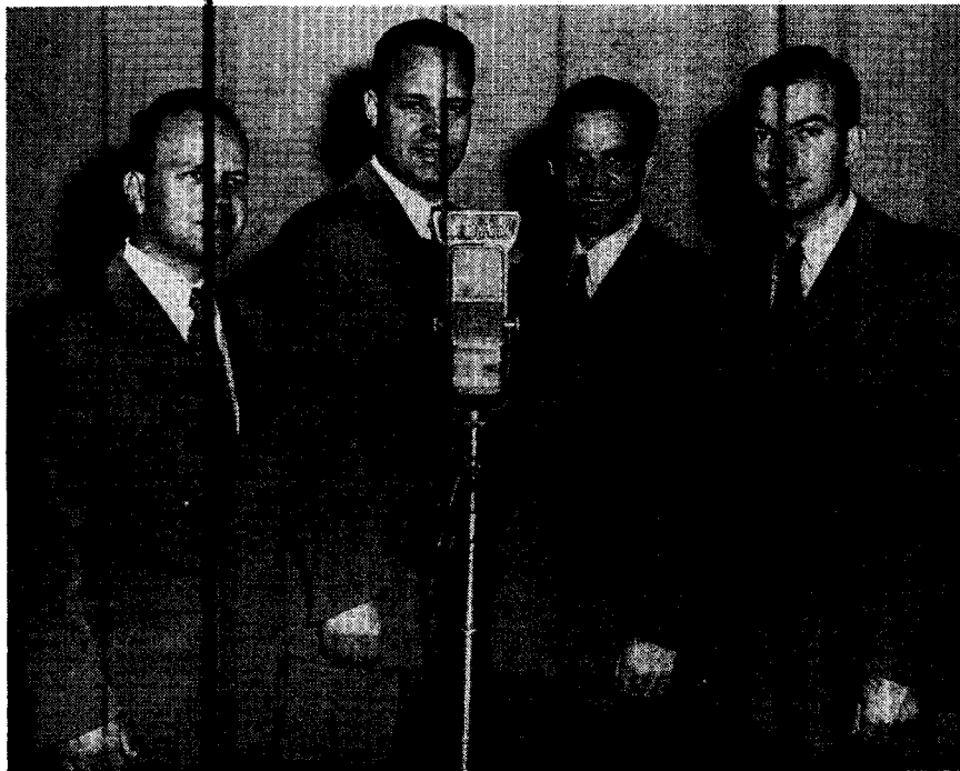
Voice of Prophecy Quartet