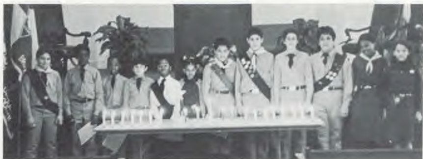
The Spanish Central Brooklyn and the Brooklyn Pathfinder clubs held a joint Induction ceremony in which 12 Pathfinders were inducted.