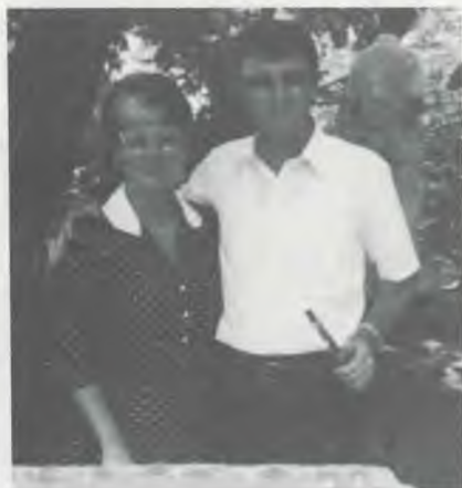
Answering God's call. . .and ready to "serve."