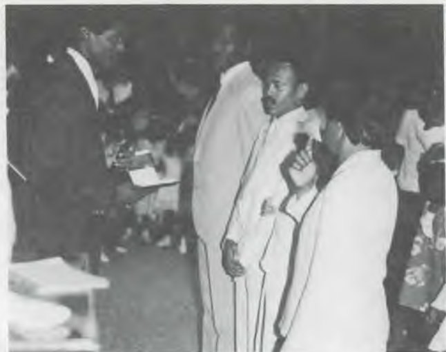
Wedding ceremony of couple on July 26.