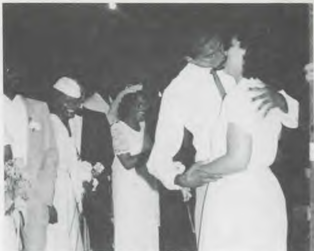
Couples renewing their vows