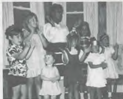
The V.B.S. children singing during the graduation exercises in South Buffalo, New York.