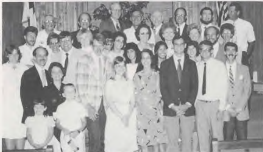
Three generations of Seventh-day Adventists.