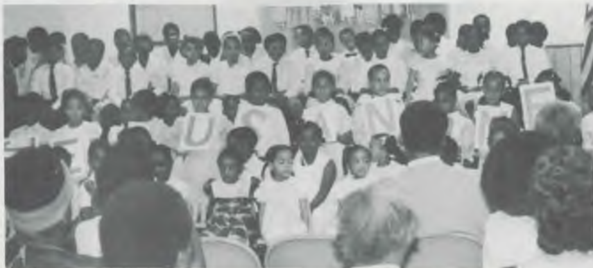
Some of the children of the large Vacation Bible School held in the North Bronx church. Anti-drug education was a featured part of the school.

about the effects of drugs, especially the current epidemic of "crack." The motto they introduced to the children was, "Thanks, but no thanks." Their presentation included role-playing, visual aids, and a question-and-answer period.