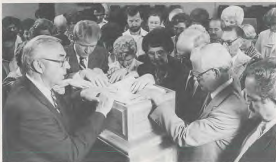
Voice of Prophecy staff meet in the Worldwide Prayer Circle every Thursday morning at 8:00 a.m. to pray for the hundreds of people who have sent prayer requests. God's answers to the intercessory prayers offered are often a strong witness to those who write.

often look to justify it. The Seventh-day Adventists seem to love the sinner, yet hate the sin. This brings hope to repentant sinners."