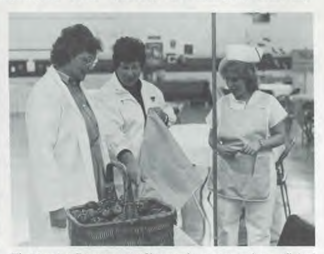
The Nursing Department offers apples as preventive medicine!