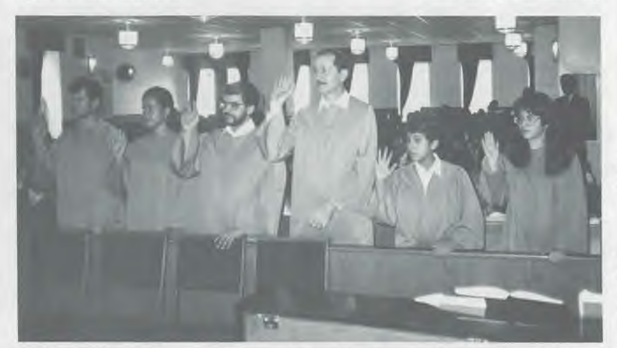
Six baptismal candidates at the Central Brooklyn Hispanic church affirmed their acceptance of the Lord and Seventh-day Adventism on October 25.