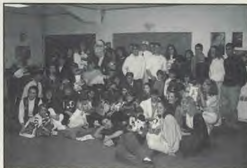
Happy Pine Tree Academy students with appreciative children.

A few days later a large poster arrived at the school—on it were the handprints of each child expressing their thanks for their special day. The students at Pine Tree Academy are already making