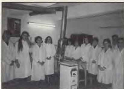
Some of the third-year nursing students, standing by their desks and a wood stove.

Located three hours north of Bucharest, Braila Nursing School