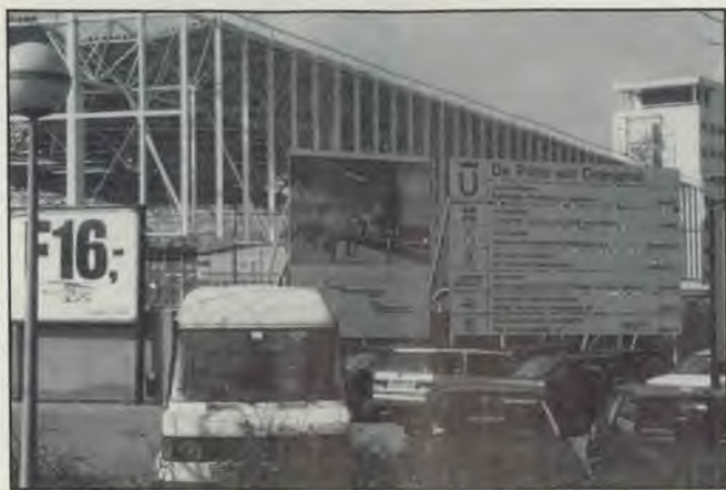
Under construction, the new Prince of Orange Hall will welcome Seventh-day Adventists among its early congregants. A November 1993 conference in the new Prince of Orange Hall ensured that the building will be fine for the Seventh-day Adventists to use in 1995!