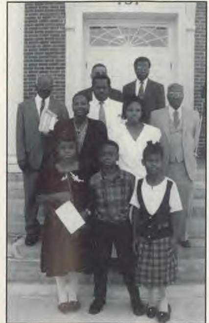
Pictured are the instructors of the seminar, the graduates, and the person baptized.