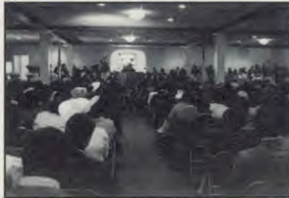
The attractively renovated sanctuary of New Haven church was filled to overflowing during the special weekend. Among the special music featured were selections and a mini-concert by two choirs that came from Toronto, Canada, to share in the joyous celebration.