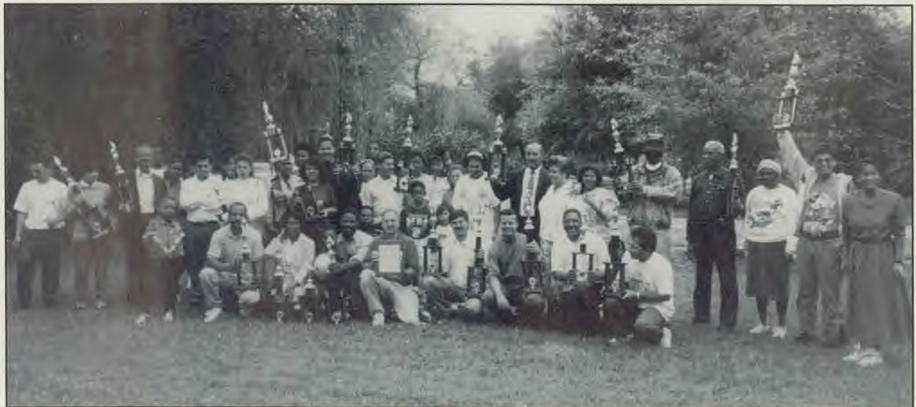
Greater New York Literature Evangelists and their families and leaders hold aloft the trophies they received for 1993 book deliveries.