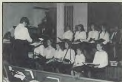
The Cantata Choir

The performance ended with both the congregation and choir holding lighted candles, and musically expressing their love for Jesus.