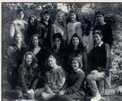
The Greater Boston Academy Class of 1994.