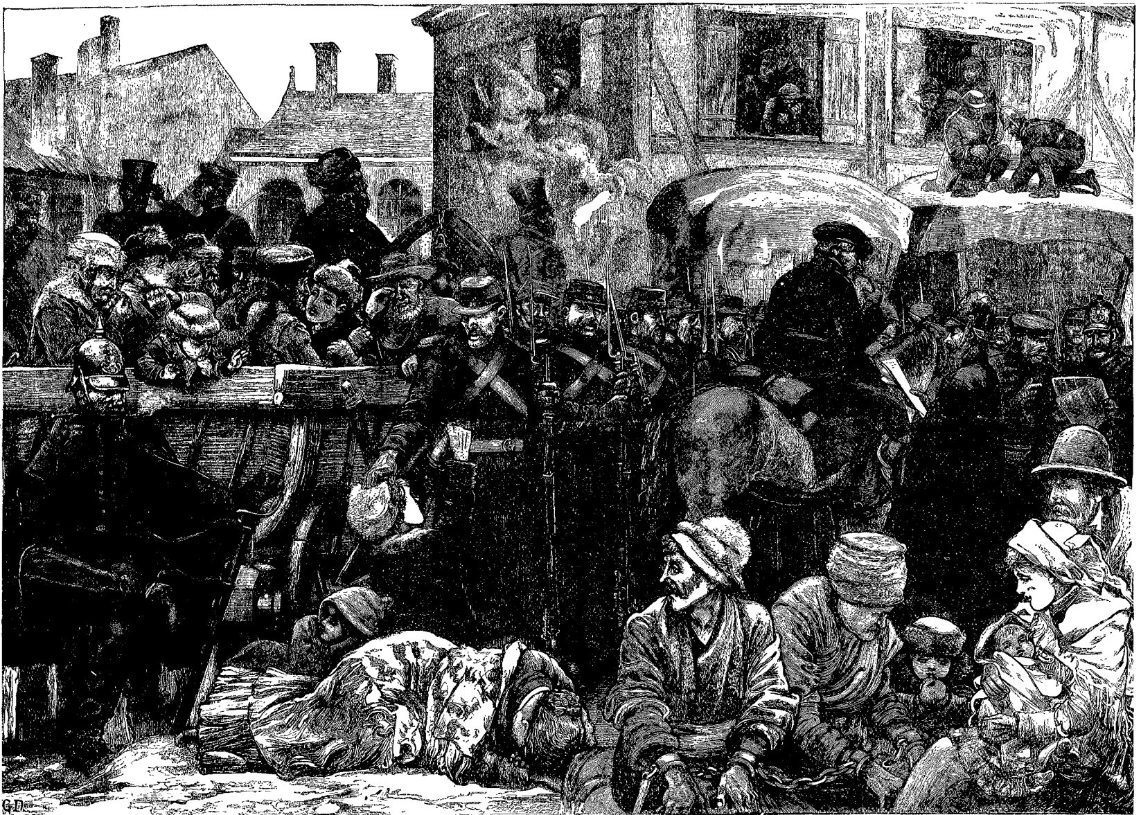
Exiled to Siberia for Their Faith.