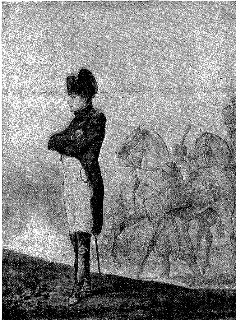
"I Do What I Please."—Napoleon, June, 1796.

On the other hand, and against the aggre-