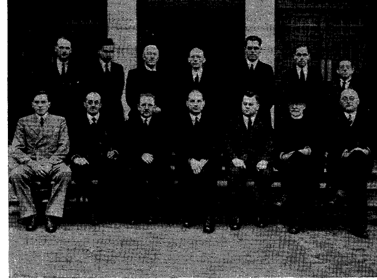
Evangelists of the South England Conference.

"THERE is much about life and its mysteries we do not know. But we know the love of God and we confide in it."