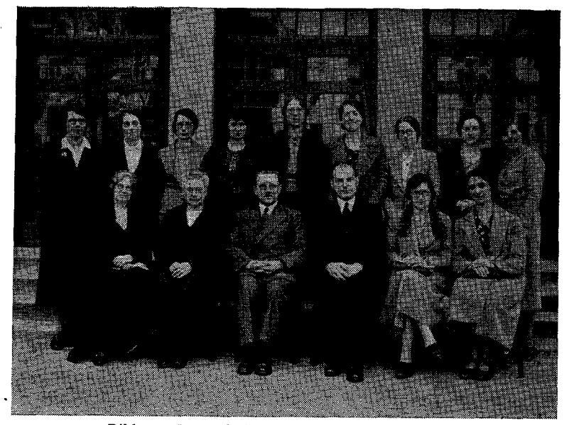
Bible-workers of the South England Conference.