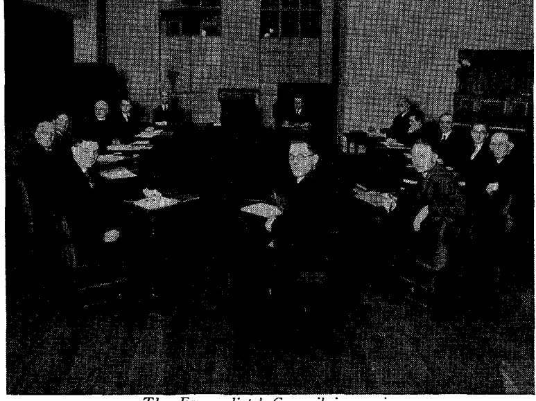
The Evangelists' Council in session.

We had met better to understand the technique of soul-saving. We had met to exchange thoughts and ideas which would make us