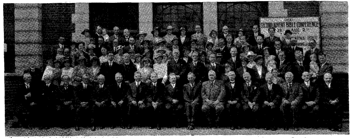
South England Conference workers and their families at the Annual Meeting in London.