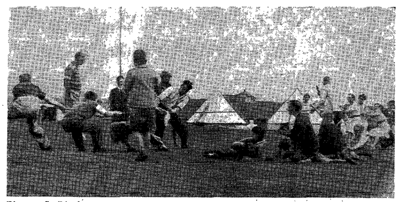
An exciting moment during a tug-of-war at Silecroft Camp.

ined by a visit to the Millom iron ore mines, some of the largest in Great Britain. Space would not permit a description of the various places visited.