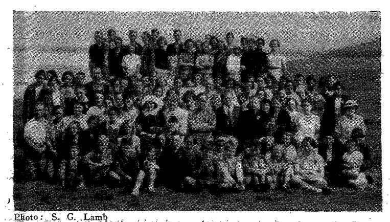
A happy group of Missionary Volunteers at the Silecroft Camp, Cumberland.