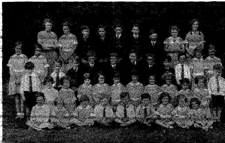
Pupils of the Stanborough Park Church School, Watford