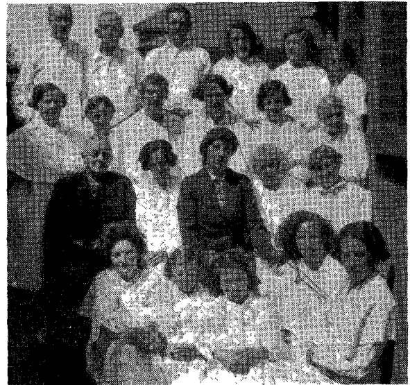
Baptismal group at Bournemouth.

These baptisms, with the one held earlier in the year, will establish the work in this district on a strong basis. The new Ilford church will now have a membership of seventy, and the Romford company was duly organized into a church of thirty members on Sabbath, July 15th. These two new churches