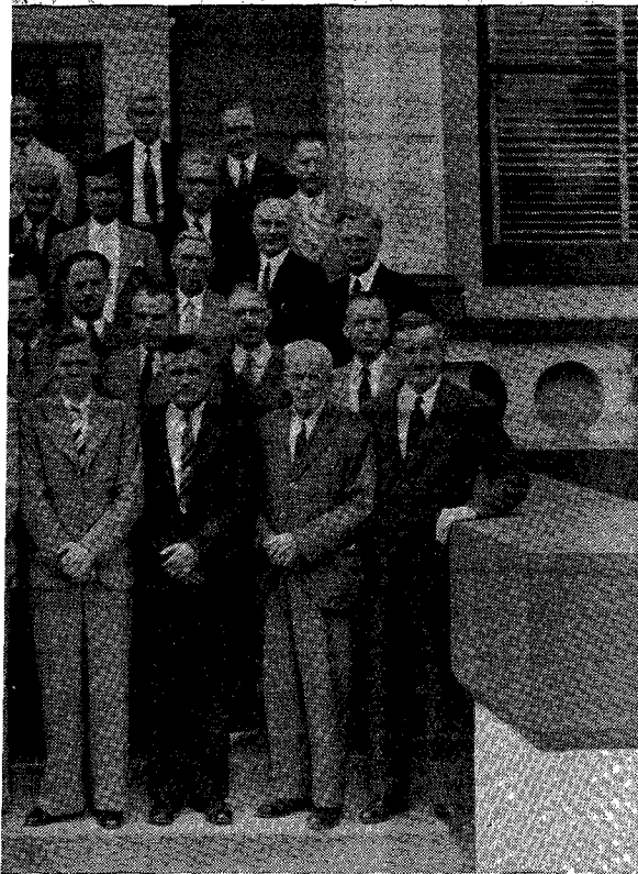
World assembled in council at Washington, D.C.