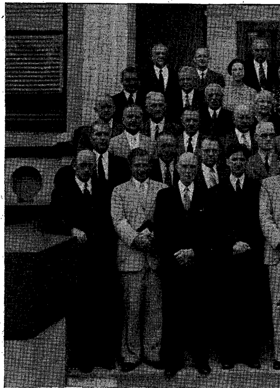
Editors of Adventist publishing houses throughout the world.