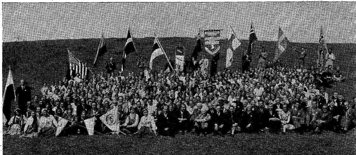
A fine group of young people who attended the recent Youth Congress in Denmark.

To many this was their first experience abroad. To such the stamping of passports, the examination of baggage by customs officials, the exchange of money, and the difficulties experienced with the language, added interest and educational value to the journey. The journey through Holland, Germany, and Denmark was certainly very interesting to all. Be-