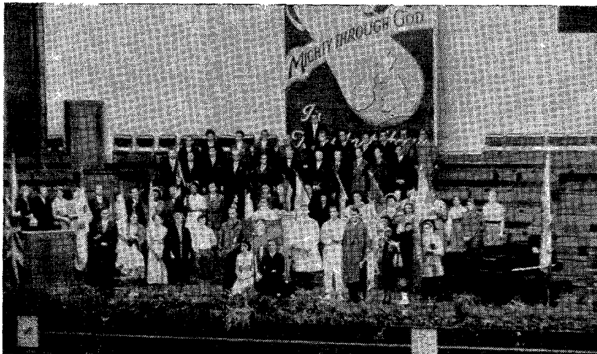
The need for, and nature of, our MV Temperance crusade, was impressively illustrated by the many who took part in the Session's Temperance Rally.

smoke until the blood is corrupted," and modern medical science has confirmed the accuracy of this statement.