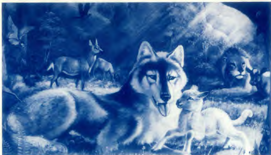
What will you see in God's heaven? Animals, plus many other things to make you happy.

It is not always easy to be God's hero, but unseen angels are waiting to help you as you shine out the love of Jesus (see Testimonies , vol. 9, page 31). And if you want to be a hero, the best kind you can be is one of God's heroes.