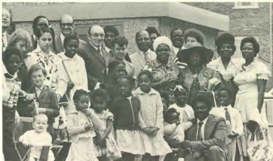
Some of the members and children of the new Top Valley company.