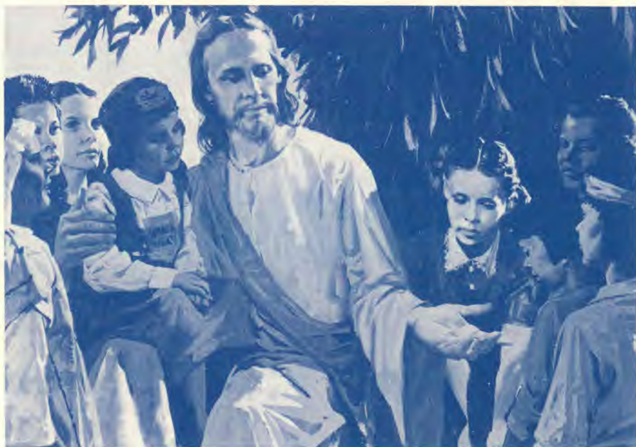
Jesus came to earth to show us His Father's love. He wants us to enjoy heaven with Him.

( Conclude the meeting with prayer bands. )