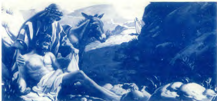
Through the good Samaritan parable Christ has shown that our neighbour does not mean merely one of the Church or faith to which we belong. Our neighbour is every person who needs help.

5. In what way is love greater than faith? than hope?