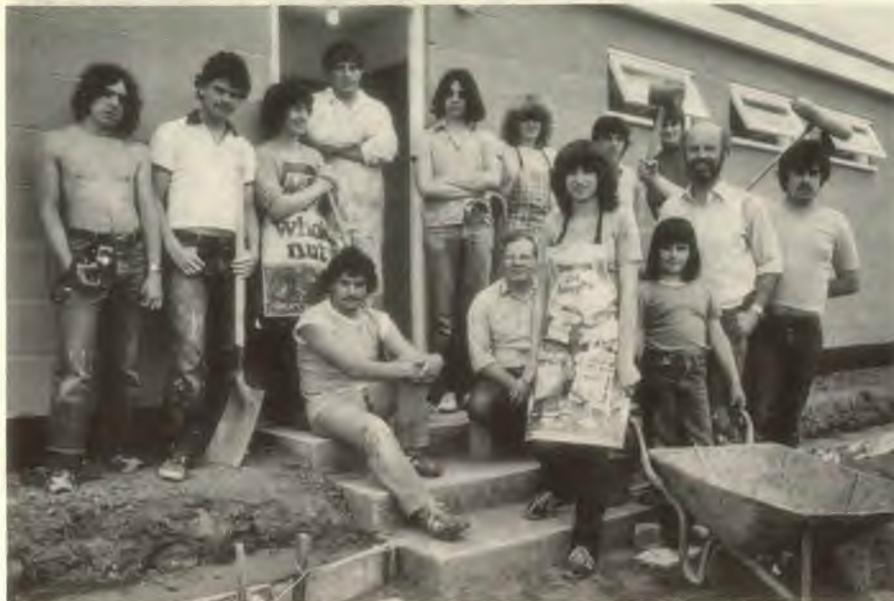
'The workers' outside the newly completed toilet block.