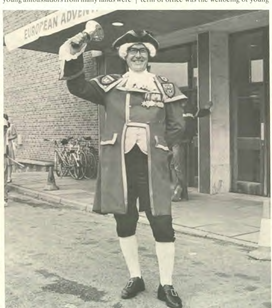
City of Exeter town crier declares the Congress well and truly open.

Workshops. Besides the presentations to the whole group of delegates in the Great Hall, one and a quarter hours each day were allotted for workshops and seminars dealing with eighteen topics of