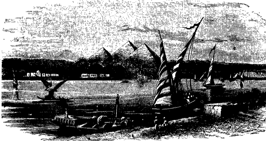
SCENE ON THE NILE.