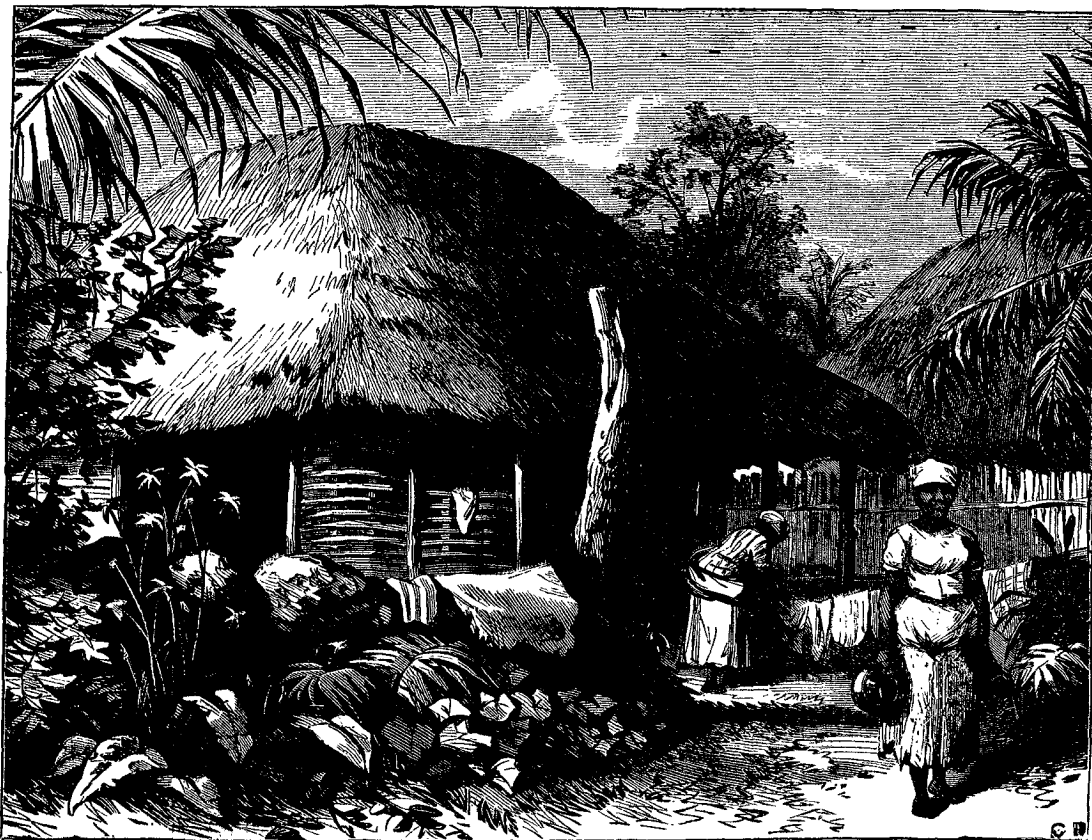
SCENE IN THE WEST INDIES SINCE THE ABOLITION OF SLAVERY. See "The Gospel in Heathen Lands," p. 297.

SOME curious figures about drunkards are given in the thirty-fifth report of the Reformatory and Refuge Union. It seems in Great Britain and Ireland 247,000 cases of persons committed to prison as drunkards occur every year. England supplies 160,200, Scotland 47,000, Ireland 40,000. Scotland here show a bad pre-eminence, only it is necessary to say that statistics of drunkenness are apt to be vitiated by a fallacy. One does not know how far the standard of drunkenness set by the police varies in different localities. In some places a man would be arrested as drunk whom the police in other places would regard as only "half seas over." Of these commitments 171,000 are males and 76,000 females. The 247,000 "cases" represent 145,000 persons, 112,000 being men and 33,000 being women. It is curious that commitments of women are more numerous than of men; that of the female commitments 50 per cent. were for drunkenness only, and 80 per cent. for drunkenness and breach of the peace; whereas of the male commitments 30 per cent. were for mere drunkenness, and 60 per cent. for drunkenness and breach of the peace. Some are convicted thirty times a year—a few even are convicted once a week regularly. The punishment, which is from one to fourteen days