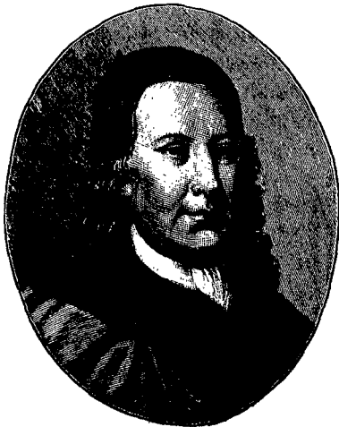
COUNT ZINZENDORF. [1732]

ALL sin is selfishness. Wrong-doing springs from supreme love of self. For personal gain, the selfish heart would inconvenience and even oppress the whole world besides. And so the strong defraud the weak. Whole