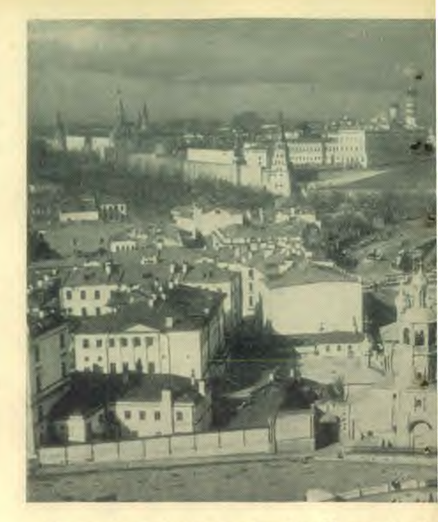
The cupolas and minarets of modern Moscow clearly

Applying this dual principle of interpretation to the last-day manifestation of the dragon in