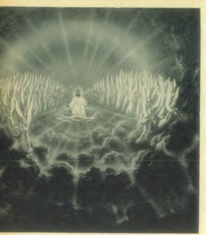
"Our God shall come."