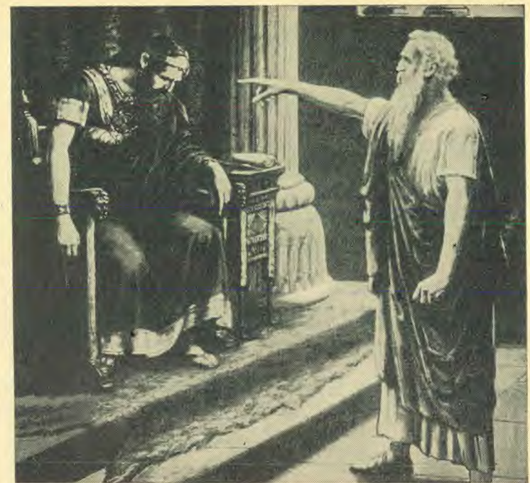
The sins of even the great king David are unsparingly exposed in the Scriptures.

Not that the Jews were any worse than the nations around. In fact, in some respects they were infinitely superior to the idolatrous peoples of those times. For the Jews did, however falteringly, endeavour to serve the Creator, the one true God. And their system of worship in the service of Jehovah was, comparatively, a model of purity and refinement. The Jewish religion produced many shining examples of personal piety even "in the midst of a crooked and perverse nation." Phil. 2:15.