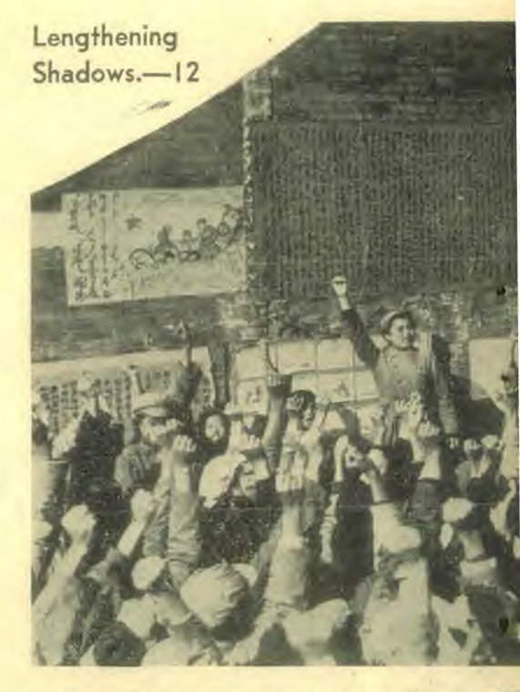
A Communist leader stirs the populace of a Ch from Wes

coming of the "time of the end," however, saw the beginning of a momentous new development in the relations between East and West.