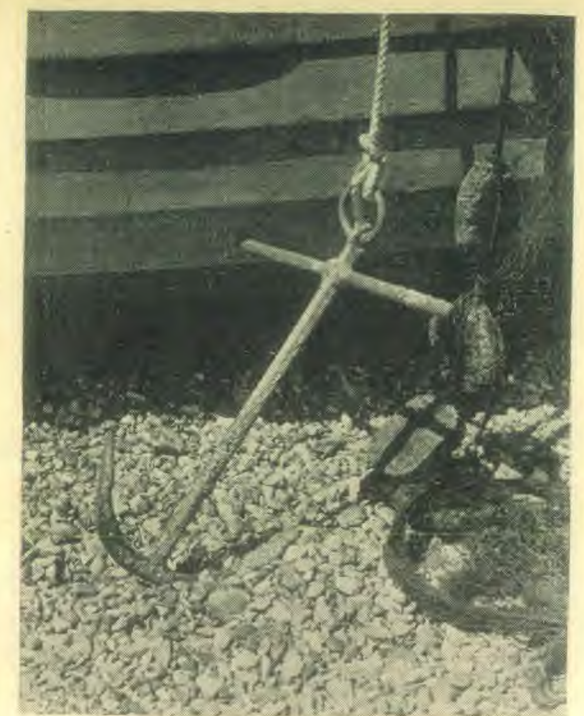
The Christian has an anchor sure and steadfast in our troubled times.

ALL around the globe to-day are signs of a gathering storm. Dark thunder clouds roll up from every horizon. From Indo-China, Malaya, Tibet, Iran, Turkey, Yugo-Slavia, Germany, come rumblings of approaching tempest. Never was a prophecy more true: "From race to race calamity extends, a mighty storm is stirring from the earth's far ends." Jer. 25:32. (Moffatt.)