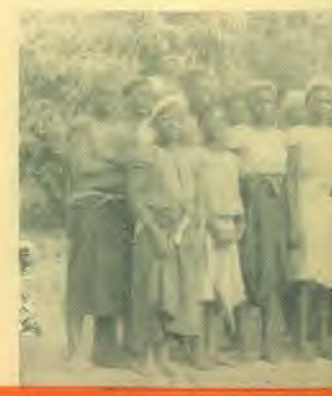
A group of lepers discharge

At present we have about 225 lepers. For about two years now we have not been able to receive new patients except to replace those who leave us from time to time. We need to increase the leper colony so as to hold at least 400 to 500 lepers.