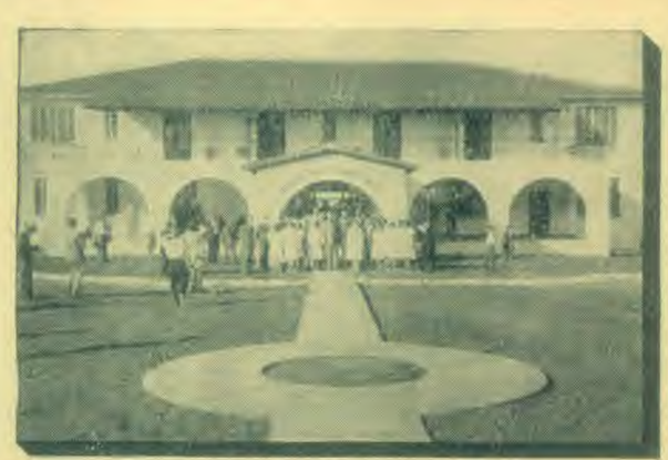
Montemorelos Hospital, Mexico. One of many centres around the world training missionary nurses for service to humanity.