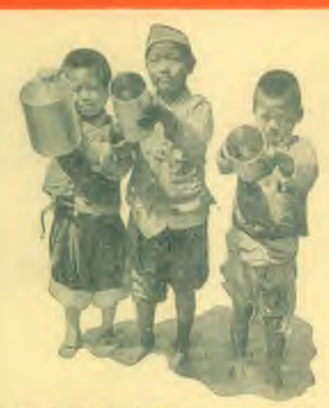
Bewildered Korean boys tragically typical of many children whose need your gift will help.