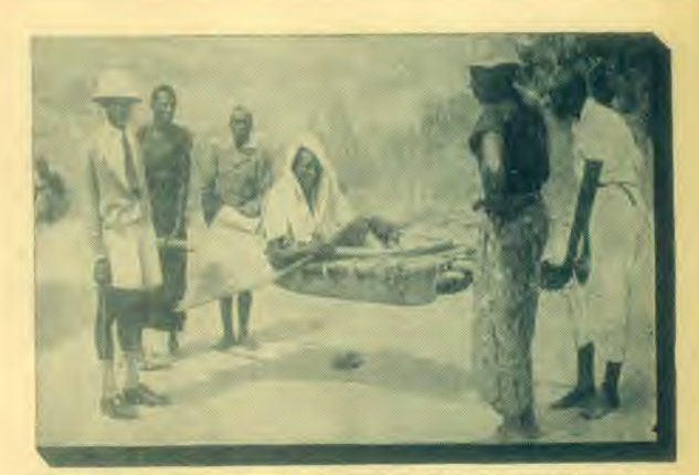
Trained natives bring the disabled to our Urundi-Ruanda mission in Central Africa, for medical treatment.