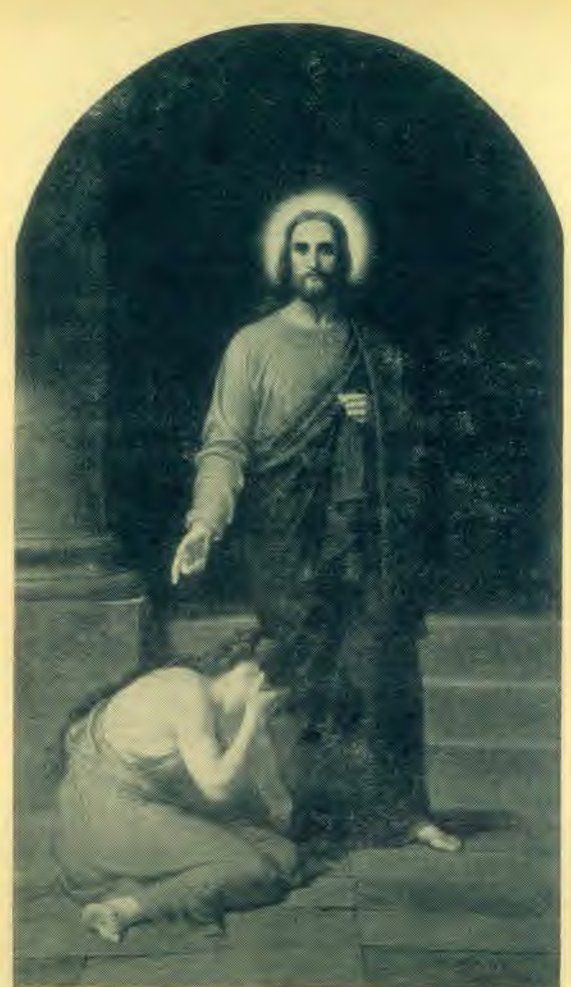
By Anton Dorph "Go and sin no more."