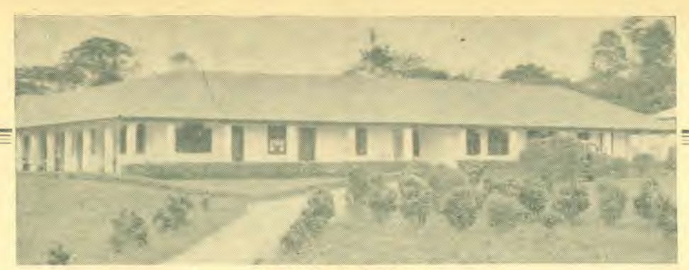
Ile-Ife Hospital, Nigeria.