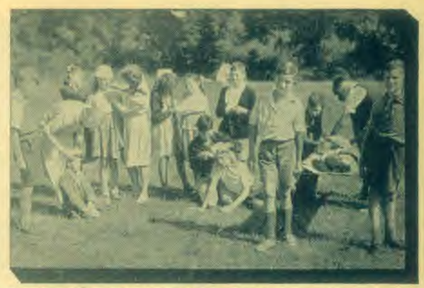
Medical missionaries of the future? Junior Missionary Volunteers learning First Aid at a Youth Camp in England.