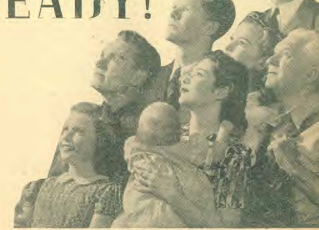
"Every eye shall see Him."

Tension among the nations is such that we are constantly conscious that a mere spark could ignite the war potential and we could be embroiled in an orgy of destruction such as history has never witnessed. Yet one day a well-known statesman tells us the war is a long way off; the next, another just as well known, will say it is only just round the corner. If they do not know, how can we?