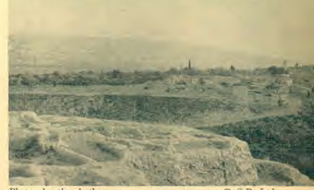
The great mound of Bethshan which guarded the way up from Jordan into the Plain of Jezreel.

When Hiram of Tyre was assisting King JULY 10, 1952