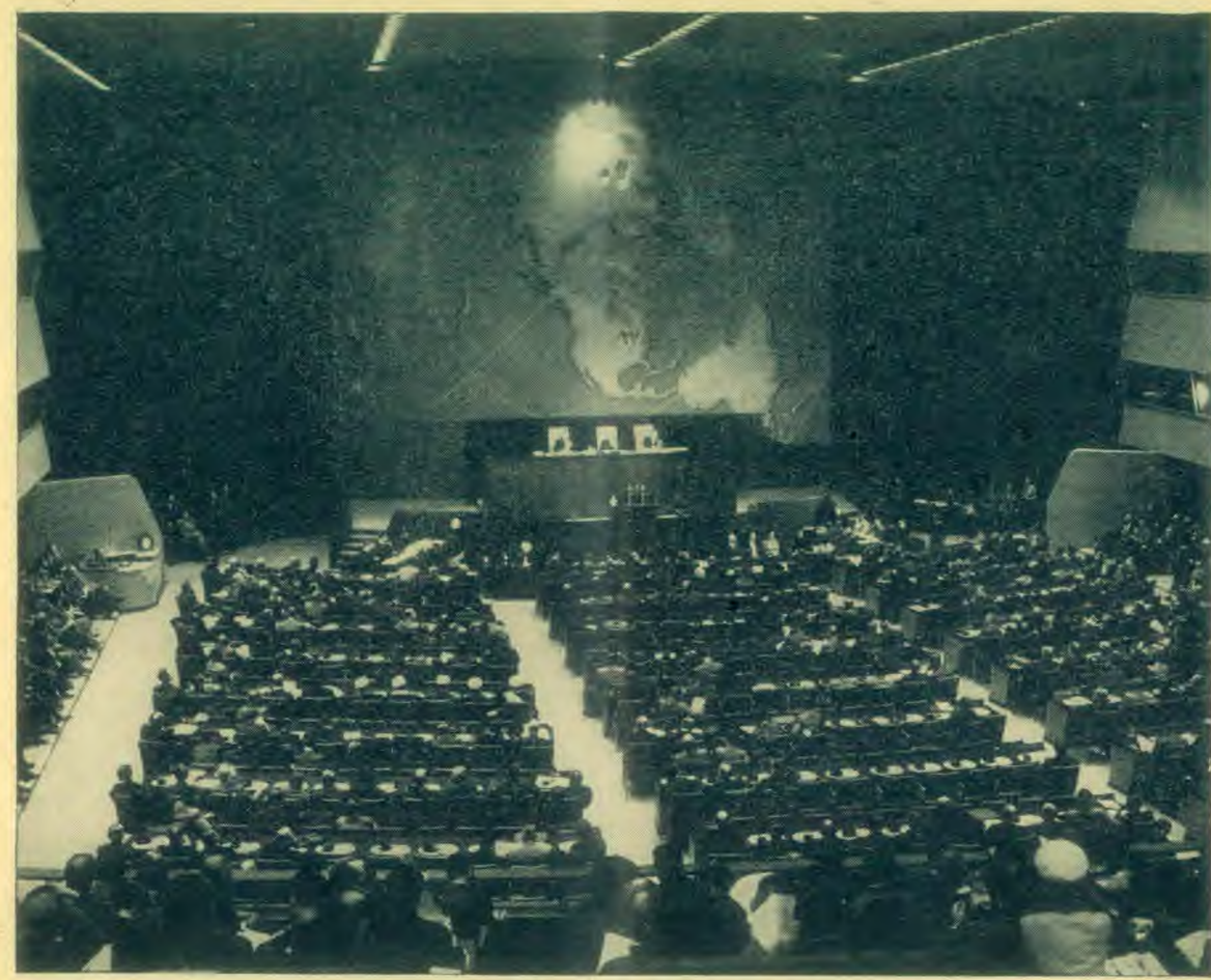
The United Nations Assembly in session,