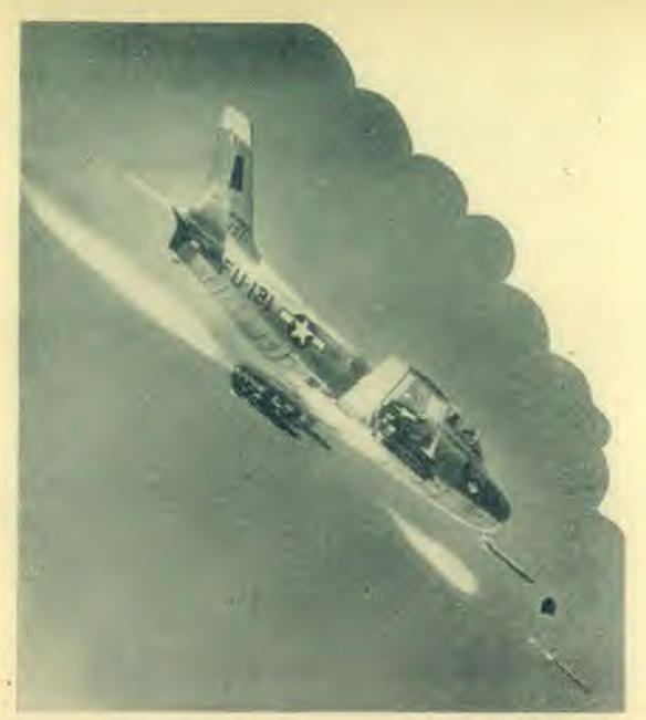
Scientific development has now reached the place where not only bombs, but rockets, guided missiles, and artillery shells can carry atomic charges.

* Ever since the explosion of the first atomic bomb on Hiroshima in 1945 the voices of scientists, statesmen, educators, and preachers have been raised in warning of the dire new threat to civilization. Again and again they have tried to stir the listless populace into a realization of the seriousness of the peril that confronts them.