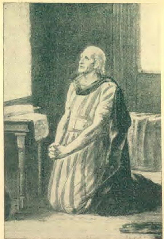
Daniel placed communion with God far above all the amenities of his earthly life.

The very way man is made demands that he stake his life on something. Its innate interests, its latent possibilities, its veiled hopes must be controlled by some directing purpose. Faced with this call from the inner voice, he must decide: What are life's true realities? What are the really valuable things it offers? Is it to live a life of ease; to have success in business, and then to retire in comfort? Is it to make a name for oneself, to win the respect and admiration of one's fellows? What are life's true realities? The answer he gives to this question will be to his life what the steering wheel is to his car.