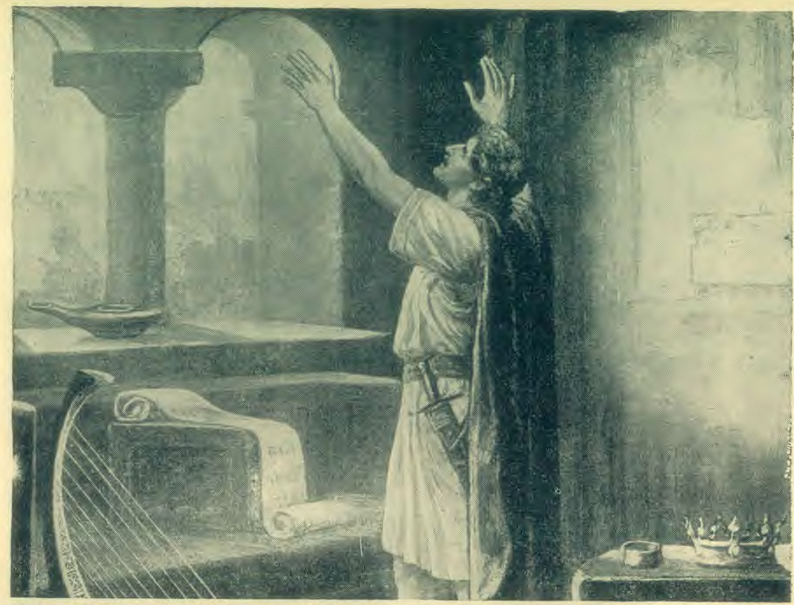
The psalmist David looked forward to the resurrection day when he would see God face to face.